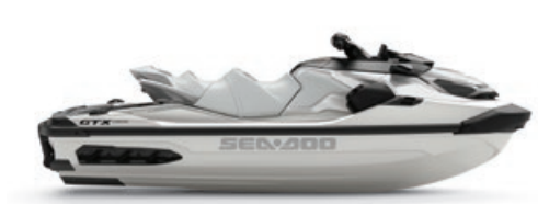
○ White Pearl Premium