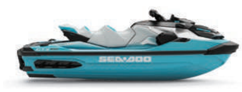
● Teal Metallic