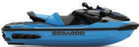
NEW Gulfstream Blue Premium