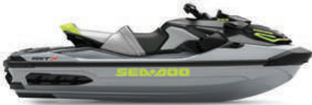
Ice Metal and Manta Green