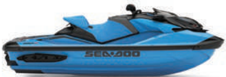
NEW Gulfstream Blue Premium