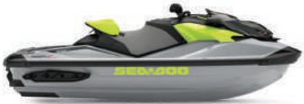
Ice Metal and Manta Green